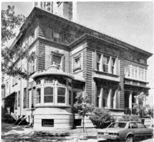
The conservatory at the southwest corner of the house is one of the finest features of the house.